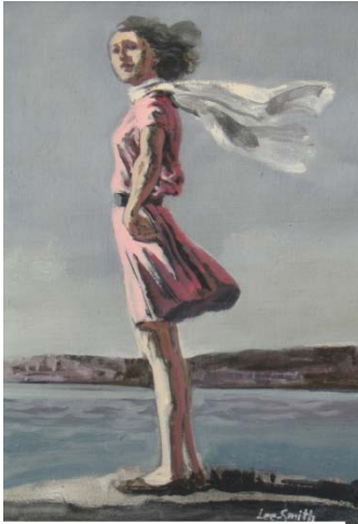
“The Wind”, ca. 1970s Hughie Lee Smith Art

DETROIT, January 17, 2009 – The Detroit Artists Market is proud to announce a special exhibition of works by Hughie Lee-Smith (1915-1999). “ Hughie Lee-Smith Returns ” opens to the public on Friday, February 13, 2009 and runs through Saturday, February 28, 2009. A Gallery Talk is scheduled on Saturday, February 21, 2009, from 4-6pm.