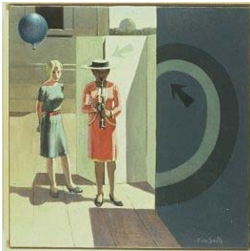
Hughie Lee-Smith, "Ambiguities" oil on canvas, 1991

Reproduction of this image, including downloading, is prohibited without written authorization from VAGA, 350 Fifth Avenue, Suite 2820, New York, NY 10118. Tel: 212-736-6666; Fax: 212-736-6767; e-mail: info@vagarights.com ; web: www.vagarights.com