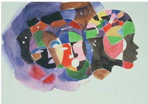
Hughie Lee-Smith, "Two Abstract Masks and Profile", watercolor and ink, 1993-94

Reproduction of this image, including downloading, is prohibited without written authorization from VAGA, 350 Fifth Avenue, Suite 2820, New York, NY 10118. Tel: 212-736-6666; Fax: 212-736-6767; e-mail: info@vagarights.com ; web: www.vagarights.com