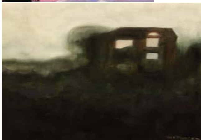
Jim Hittinger House #2 30x40"