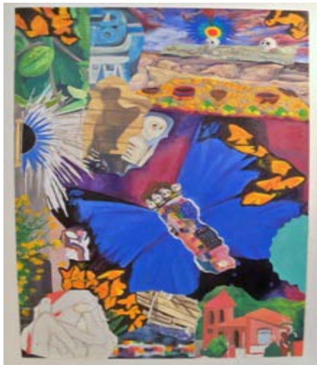
Itchel Arriaga Fly Home 36x24"